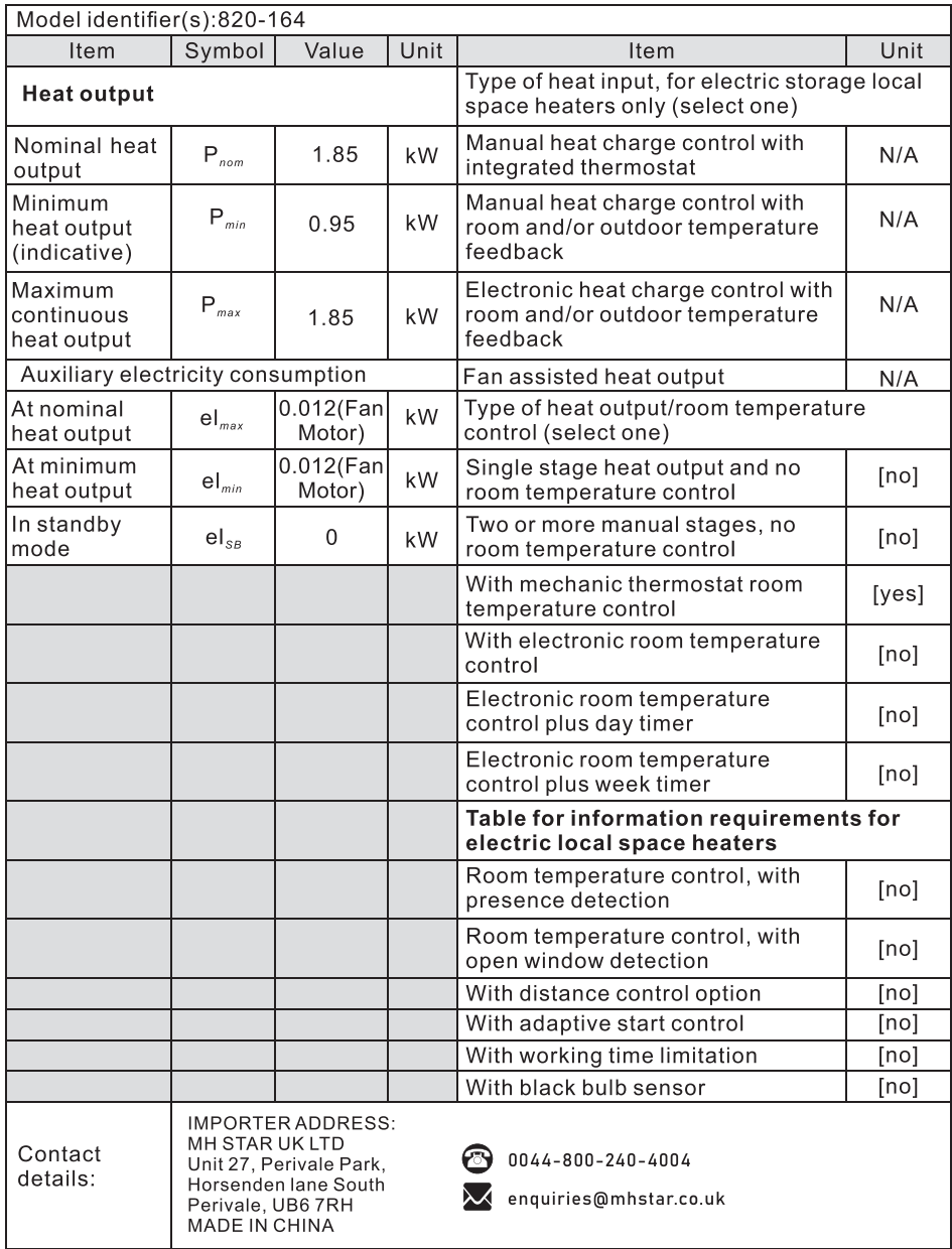
Table for information requirements for electric local space heaters.