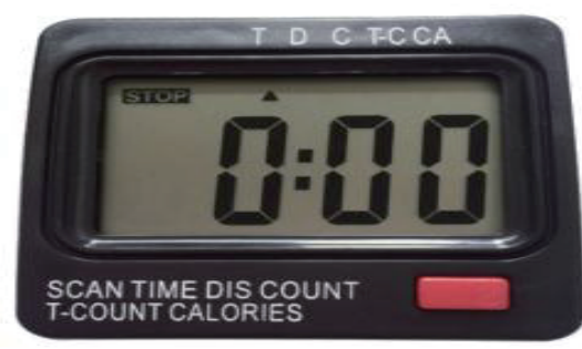
Display shows TIME

Before using this product, ensure all bolts and nuts are securely tightened. Refer to the manual for further instructions.