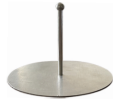
extinguishing cover (1 pc)