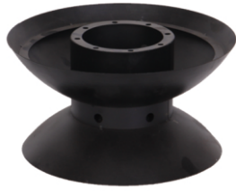
base (1 pc)