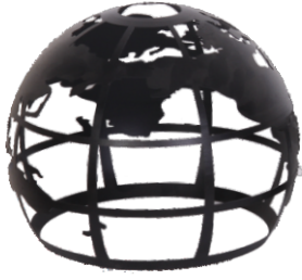
hemisphere (1 pc)