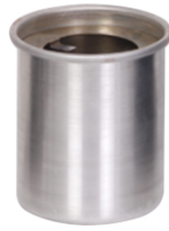
fuel can(1 set)