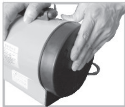
5、 Recover the back