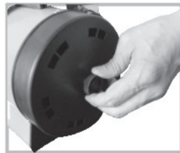
6、 Finally, tighten the screws