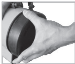
2、 Then remove back cover