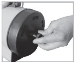
1、 Loose screws in back cover first