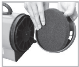
4、 Reload filter after cleaning