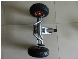
2.rear car frame*1