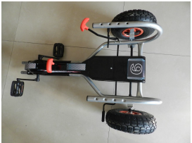
1.front car frame*1