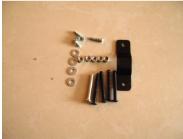
8.bag of screw*1